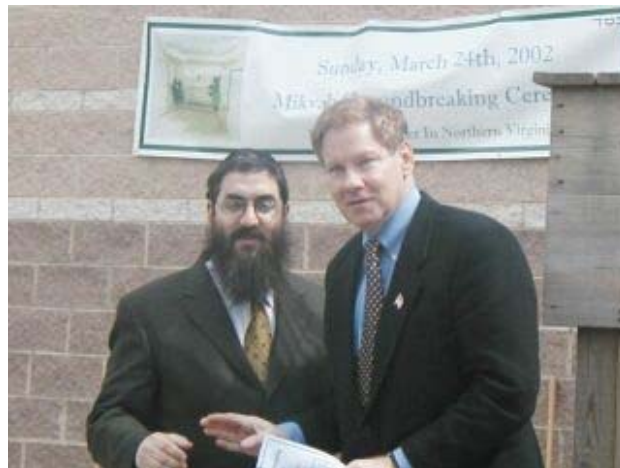
Congressman Tom Davis Jr.